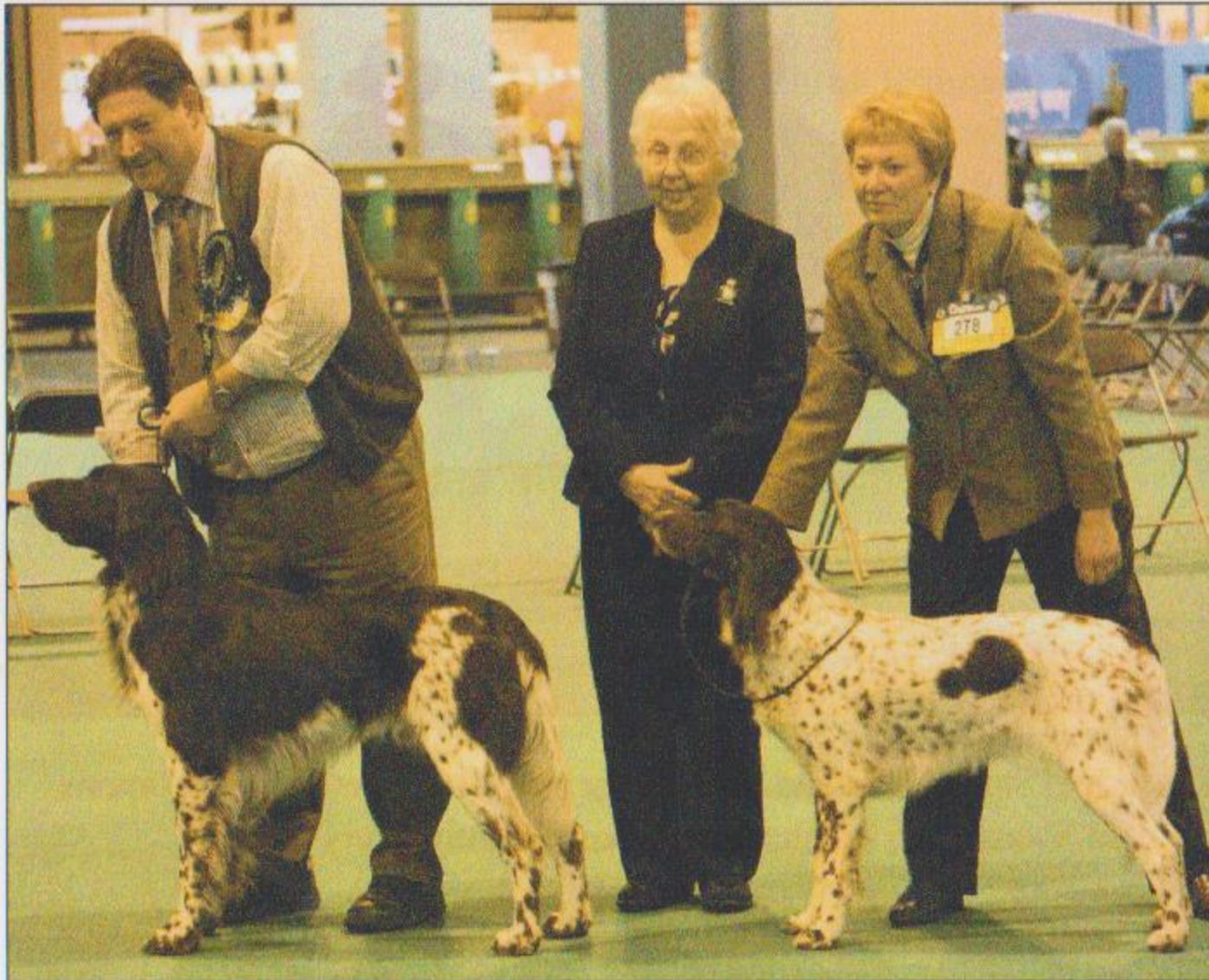
Best Dog Arany's Busche