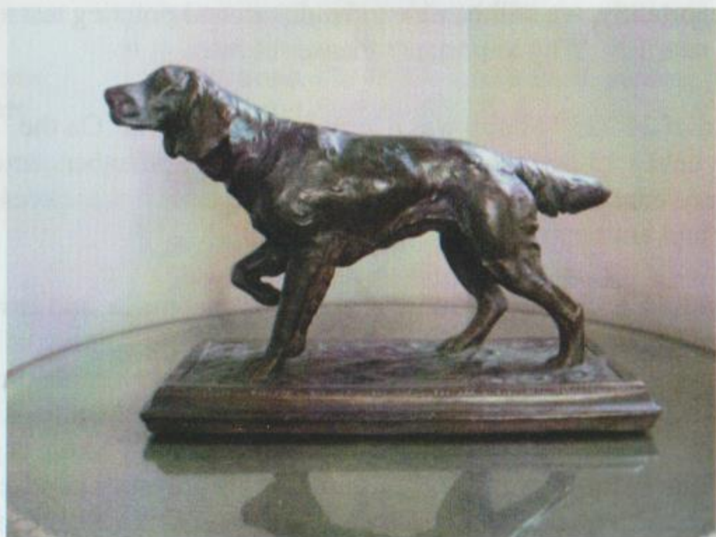
German Longhaired Pointer Statue presented to the Club by Nederlandse Vereniging "Langhaar"