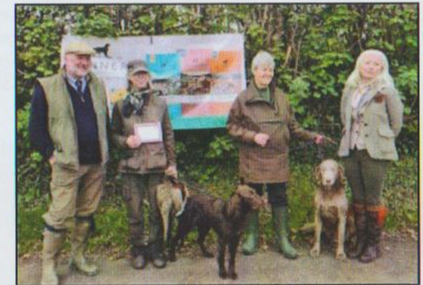
Weimaraner Association All Aged 1st place and Guns' Award

In November, we entered an All-Aged trial at a local ground.