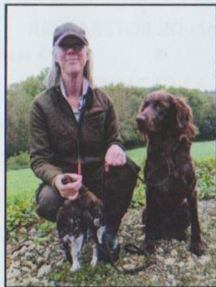
Guns' Award at Danby Moor

The first two trials I entered were Novice stakes on grouse. They were held in Yorkshire on consecutive days in September 2021. I chose these grouse competitions for Weasel's first trials as I have been extremely fortunate to have been able to