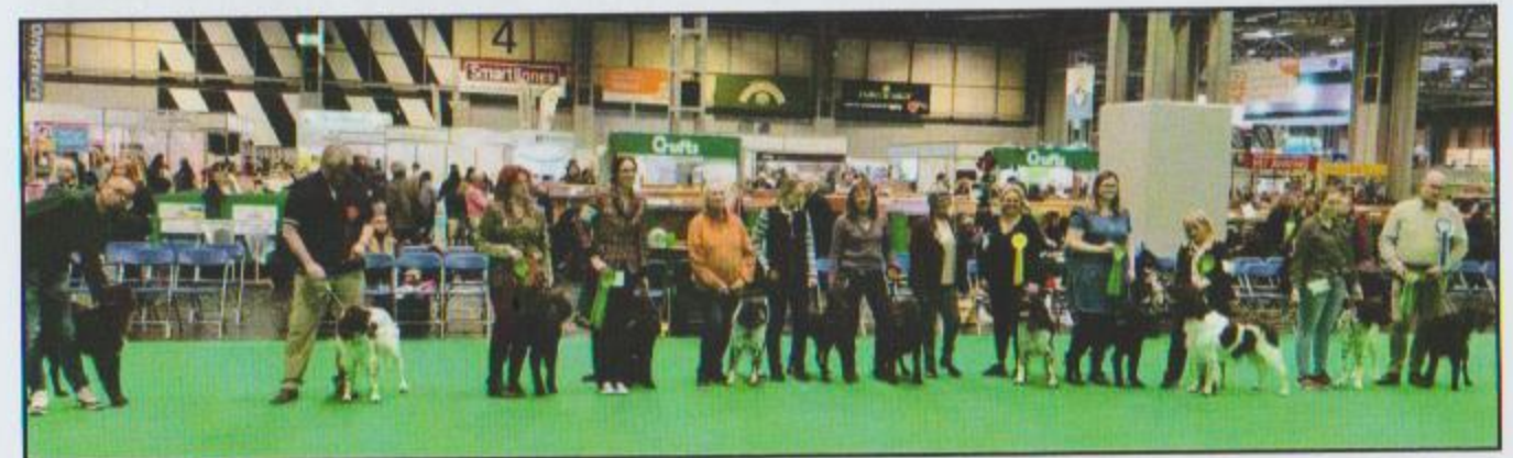
16 GLPs were present at Crufts this year from all over the UK and Europe