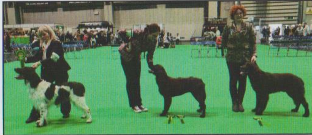
Best of Breed and Best Dog, Best Puppy and Best Bitch, Best Veteran