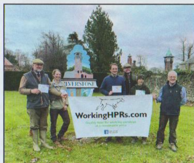
Award winners and judges

Third run - Working the woodland with the wind to her back. Made a good job of covering the ground. A pheasant was shot